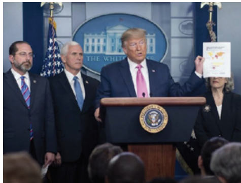
President Donald Trump speaks during press conference where he puts Vice President Mike Pence in charge of U.S. coronavirus response, Feb. 26.

At presstime NBC News reported The Federal Emergency Management Agency (FEMA) was planning for the possibility that President Trump could make an emergency declaration to bring in extra funds and personnel to assist the administration's response, according to internal documents obtained by the news outlet.