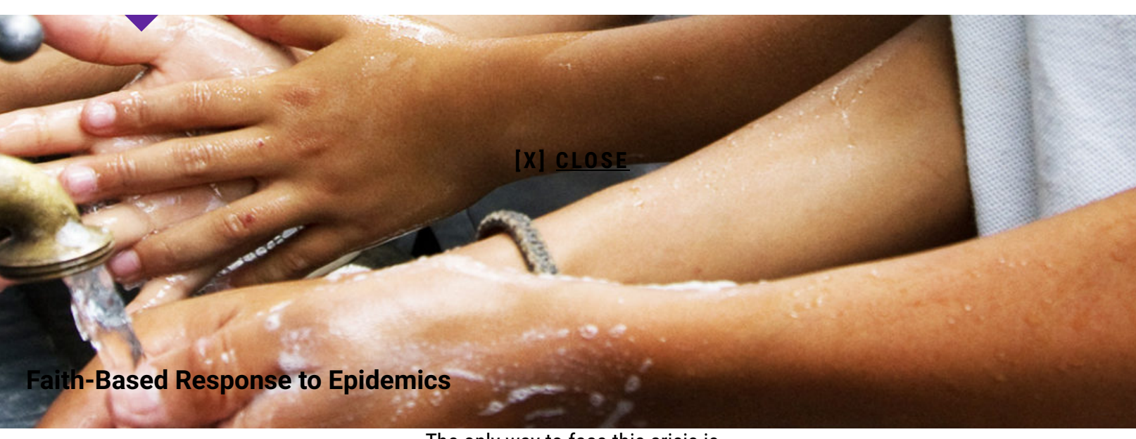
The only way to face this crisis is together.