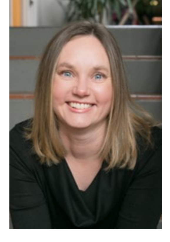
Looking for more? Check out my new book - The Mindful Christian - now available wherever books are sold!