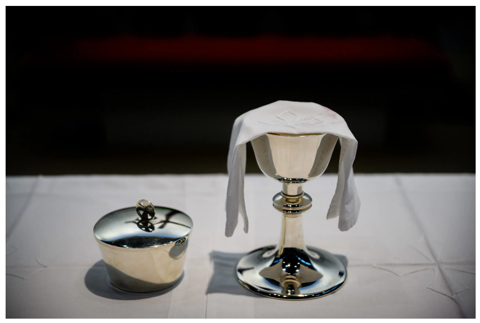
Immanuel Lutheran Church in Amherst, Massachusetts.