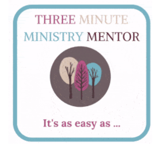
Sign up for Three Minute Ministry Mentor Today