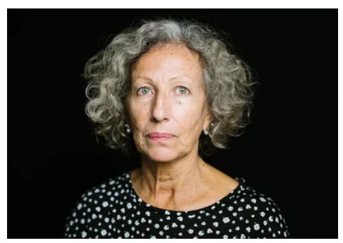
People Who Retire Comfortably Avoid These Financial Advisor Mistakes smartasset