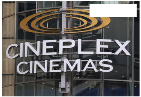
Canada's Cineplex adopts poison pill 19 Jun