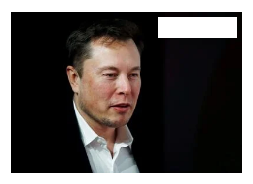
Elon Musk sells Bel-Air house to Chinese billionaire for $29...