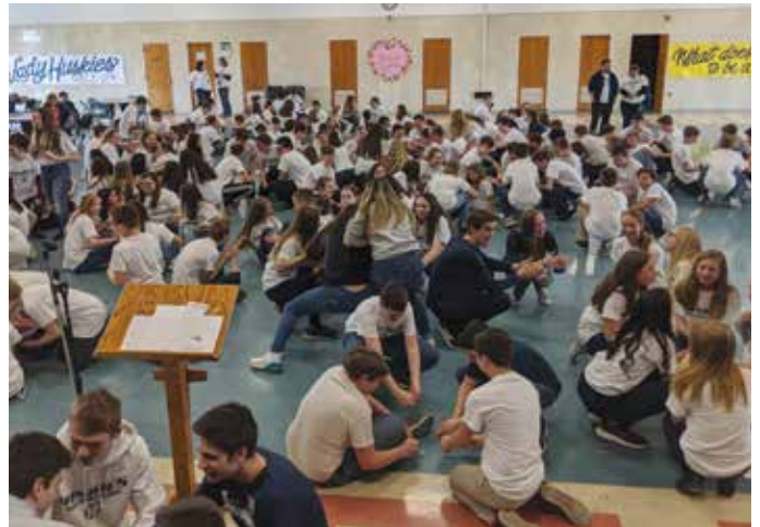
Students Enjoy the 2020 Junior High Lenten Retreat.

As I shared in the fall 2019, the Diocese will no longer provide funding to Bishop Carroll beginning in the 2020-21 academic year. This represents $200,000 of our budget. As a community, we are grateful for the support the Diocese has provided and for its ongoing spiritual leadership. Our team has been working tirelessly to fill the $200,000 funding gap through programs like EITC and Named Scholarships, which