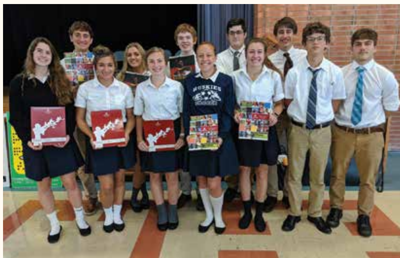
Students celebrate early acceptance into SFU

Bishop Carroll is blessed to have a world-class university in its backyard. Faculty and administrators work hard to make sure students can access and benefit from the many opportunities that SFU makes available. Alumni and friends of Bishop Carroll can be part of this relationship, too!