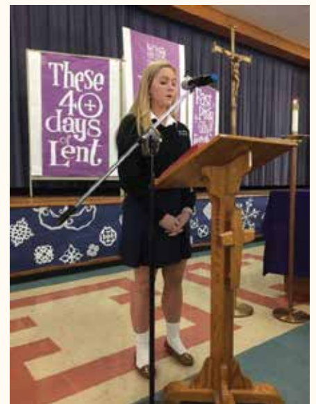
Students participated in Ash Wednesday Mass at school.

I welcome your input and questions at any time. Please don’t hesitate to reach me at (814) 472-7500 or at lweber@bishopcarroll.org .