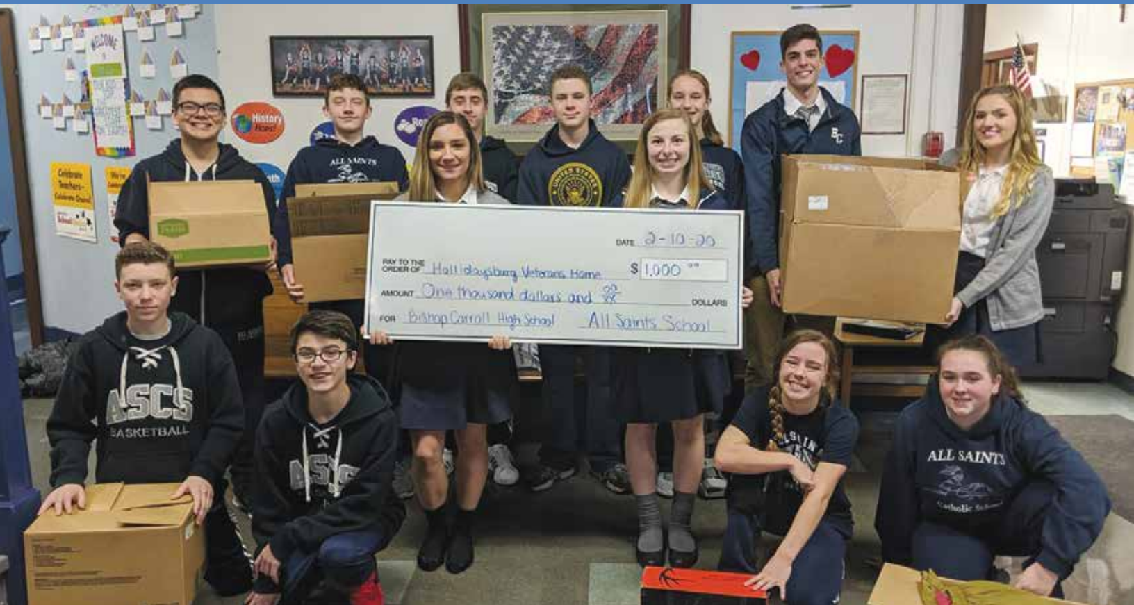
For Catholic Schools Week students partnered with All Saints Catholic School to raise funds for the Veterans Home in Hollidaysburg.