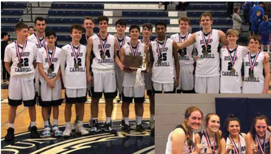
The boys and girls basketball teams both earned District 6 Championship titles.