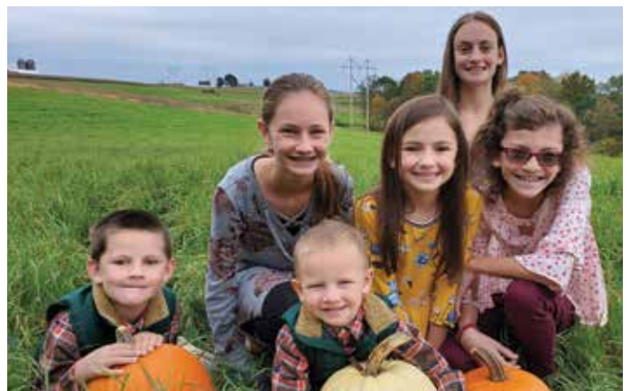
The Golden kids