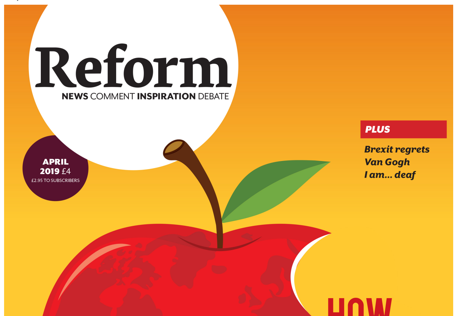
Why read Reform?